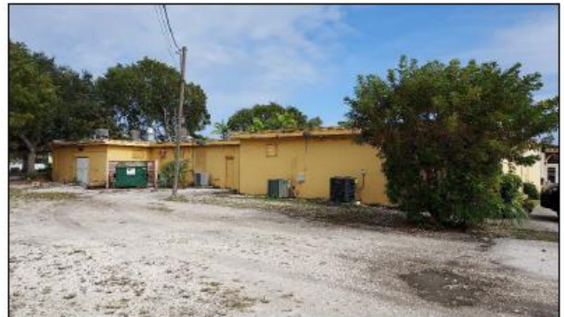
VIEW OF REAR OF SUBJECT BUILDING