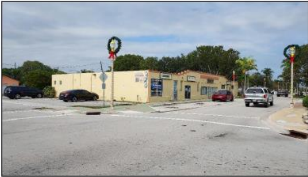
VIEW NW OF SUBJECT

Bidders are encouraged to visit the Project Site on their own time.