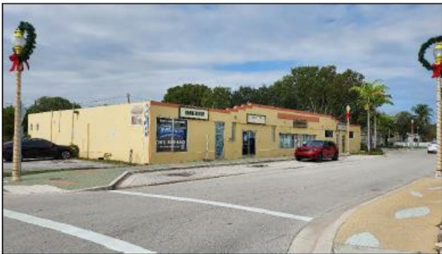
VIEW NW OF SUBJECT