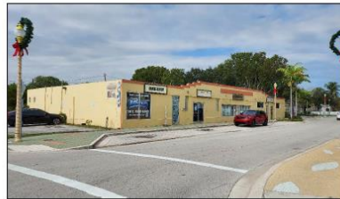
VIEW NW OF SUBJECT