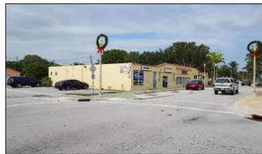
VIEW NW OF SUBJECT