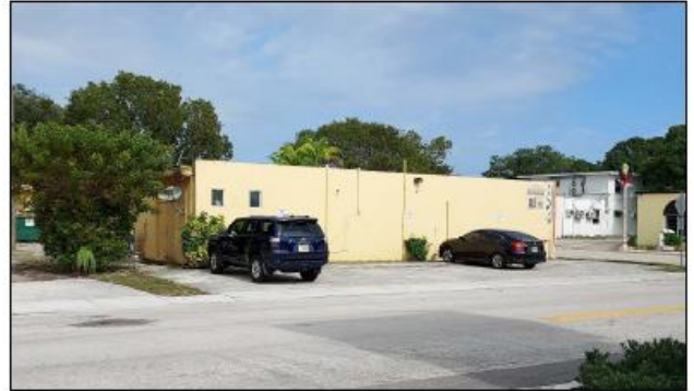
VIEW NORTHEAST OF THE SUBJECT FROM NW 1ST STREET