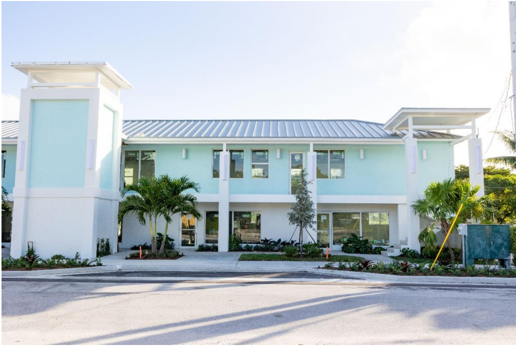
View on NW 1 st Street