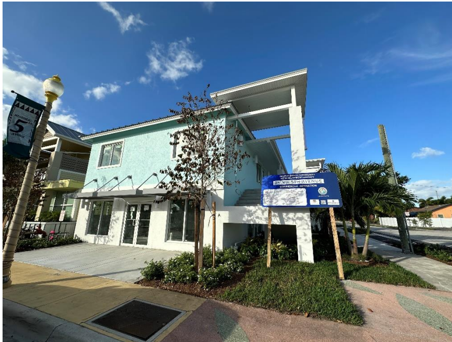
View on NW 5 th Avenue