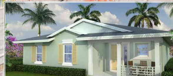
Art by Cherie Saleeb