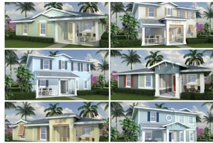
Corey Jones Isle Workforce Housing - 10 Homes