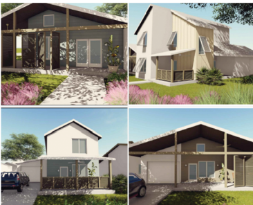
Carver Square Workforce Housing Dev. - 20 Homes