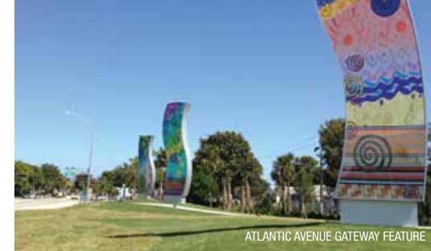
ATLANTIC AVENUE GATEWAY FEATURE