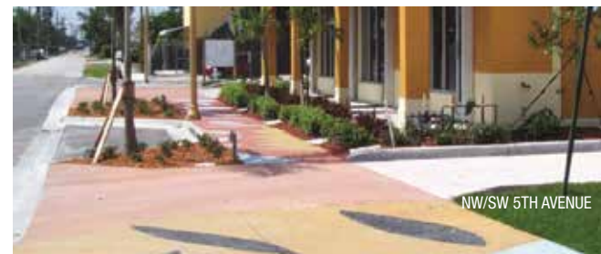
NW/SW 5TH AVENUE

The gateway feature at the intersection of Interstate-95 and West Atlantic Avenue marks the western entrance into Delray's downtown. Part of the 2002 Downtown Master Plan, this artistic entrance feature was funded by the CRA and the Florida Department of Transportation. Efforts were made to solicit community input with the goal to design a feature that would reflect Delray's history and diversity. The $1.2 million public art project was created by renowned textile artist, Michelle Newman, and included six decorative 30-foot columns, a unique set of trellises, landscaping, and sidewalks.