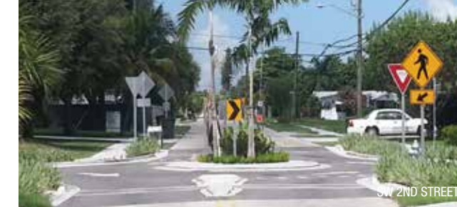
SW 2ND STREET