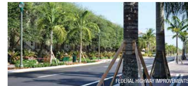
FEDERAL HIGHWAY IMPROVEMENTS

The 2002 Downtown Master Plan and the SW Area Neighborhood Redevelopment Plan identified this corridor as a "secondary circulation system." The beautification and traffic calming project was a joint City/CRA project featuring landscaping, roundabouts, and sidewalks. The improvements were completed in 2014.