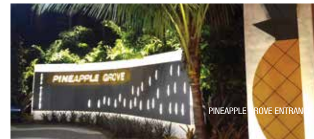
PINEAPPLE GROVE ENTRANCE

This streetscape improvement project was completed along NE 1st Avenue between NE 1st and 2nd Streets in 2014. The CRA invested $520,000 into the project which included on-street parking, paver brick walkways, decorative street lighting, and landscape nodes.