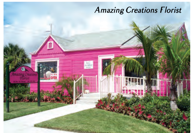
Amazing Creations Florist

This website is a public-private partnership between the Chamber of Commerce, CRA, the City and several private organizations, designed to highlight Delray's location in Florida's Southeast Economic Region and strengthen the Delray Beach Business Brand.