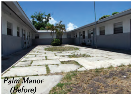
Palm Manor (Before)