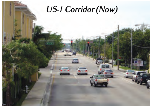
US-1 Corridor (Now)

fewer accidents without causing significant traffic delays. In the future, permanent improvements will add bike lanes, wider sidewalks, on-street parking and landscaping to make the corridor safer and more attractive.