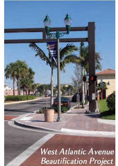
West Atlantic Avenue Beautification Project

Similar improvements have been installed along the West Atlantic Avenue corridor, with more than $2.5 million invested in streetscape improvements from Swinton Avenue to West 12 th Avenue. The planned installation of additional landscaping within the medians along West Atlantic will help to create a seamless, pedestrian friendly downtown, from Interstate-95 to the beach.