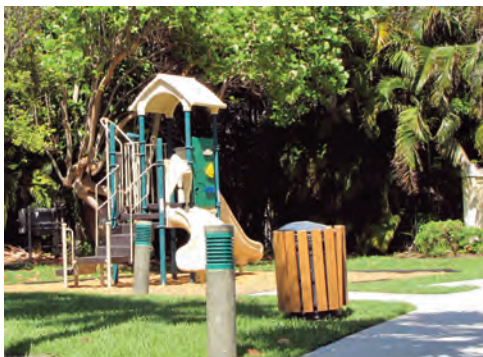
La Hacienda Gardens Pocket Park