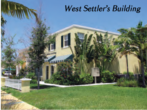
West Settler's Building