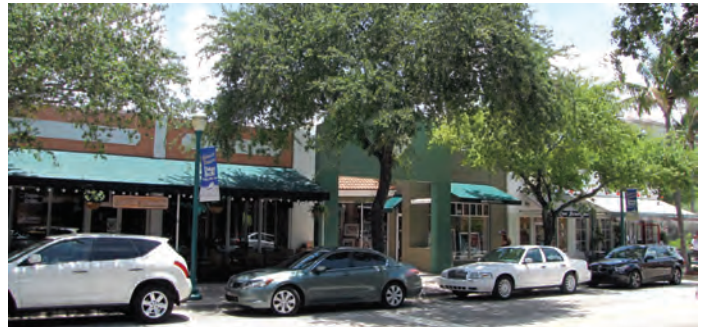
Grove Square Complex

◆ Grove Square: This restaurant, retail and entertainment complex west of the FEC railroad on East Atlantic Avenue—was another early land assembly project by the Delray Beach CRA. The project resulted in several new restaurants and an outdoor entertainment facility (the original City Limits pavilion), and was a catalyst for activity and nightlife in the downtown core.