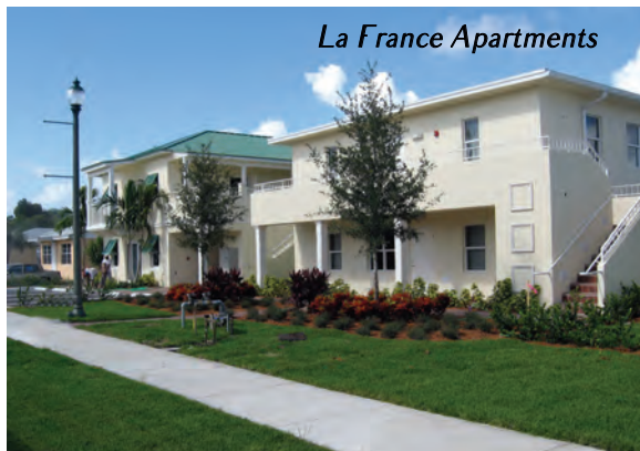
La France Apartments

nity stakeholders to determine the best use for the property. As a result, the CRA renovated the hotel into an affordable