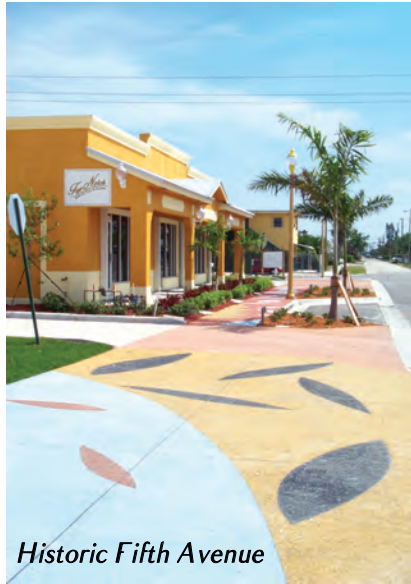
Historic Fifth Avenue