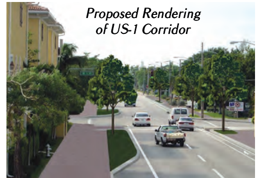
Proposed Rendering of US-1 Corridor