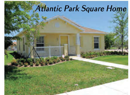
Atlantic Park Square Home