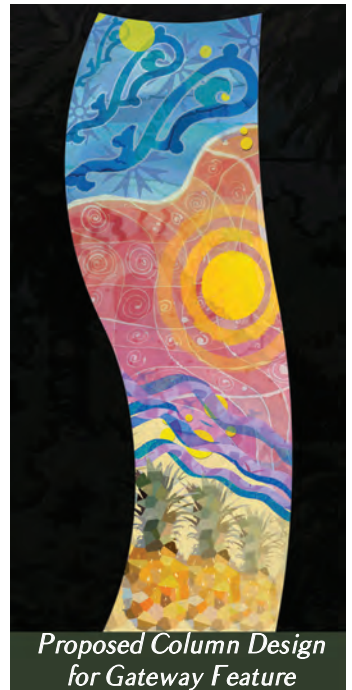
Proposed Column Design for Gateway Feature

The improvements will span the entire length of MLK Jr. Drive, along NW and NE 2 nd Street, from I-95 to the Intracoastal Waterway. The CRA has allocated $750,000 for the project, to be combined with the City of Delray Beach’s $300,000 contribution. Construction will be underway in 2011.