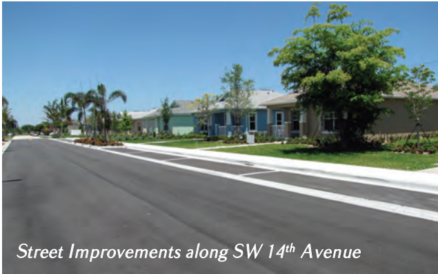
Street Improvements along SW 14 th Avenue

Major beautification projects on SW 2 nd Street and SW 12 th Avenue are in the design phases and will be constructed through CRA and City funds.