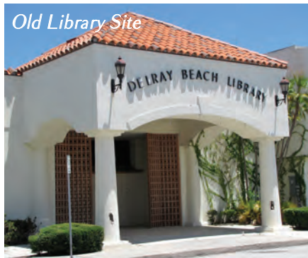
Old Library Site