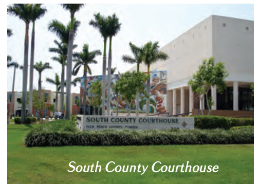
South County Courthouse