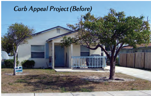
Curb Appeal Project (Before)