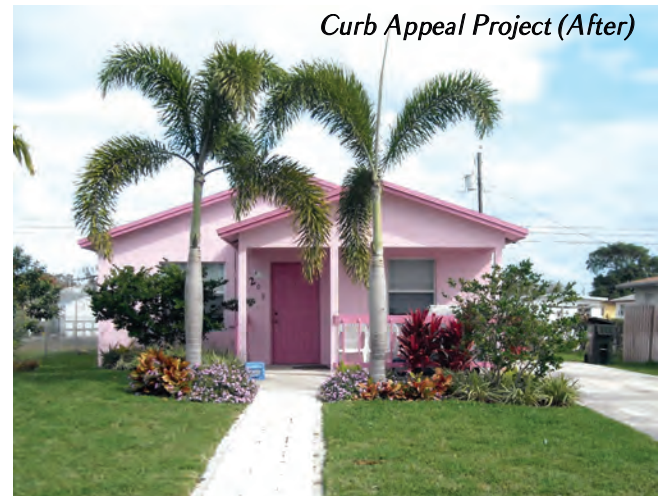
Curb Appeal Project (After)