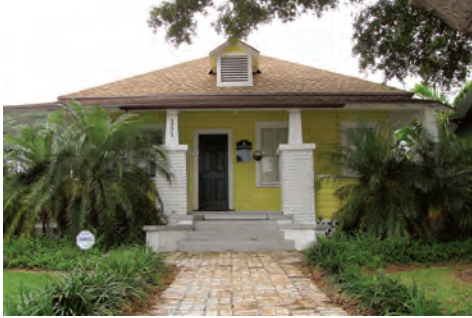
DBHS Hunt House