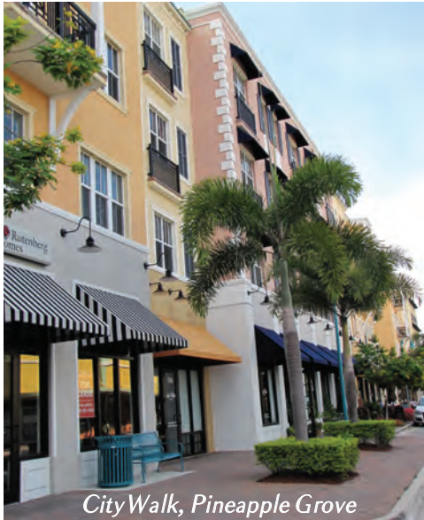
CityWalk, Pineapple Grove