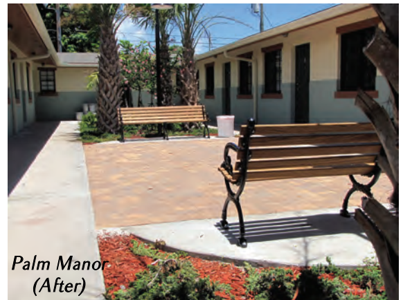
Palm Manor (After)