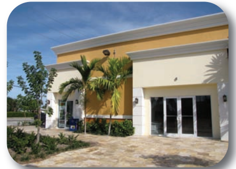
Building expansion and facade improvements to 139 NW 5 th Ave. were completed in 2008.

The CRA also assisted several property and business owners with exterior improvements through the Site Development Assistance Program. A total of $84,899.54 was awarded to several businesses in 2008, including Crepes by the Sea (NE 5 th Ave.), Mixam, Inc. (West Atlantic Ave.), Aloha Dry Cleaners (NE 2 nd Street), Sands Terrace Condominium Association (NE 1 st Ave.), and NW 5th Avenue Associates (102-110 NW 5 th Ave.). Badi, Inc., which received a $50,000 Development Regions grant from Palm Beach County, completed an extensive renovation of the food market located at 139 NW 5 th Avenue. The CRA contributed $25,000 in matching funds to the project, which included a building expansion and façade improvements, landscaping, and paver brick sidewalks, and resulted in the creation of several new jobs.