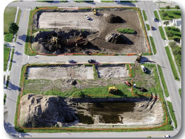
An aerial view of the soil remediation project at the site of the Carver Square subdivision.

Remediation of the environmental issues in the Carver Square subdivision neared completion this past year. After obtaining a Brownfield designation for the area, the CRA successfully applied for a low-interest loan from the South Florida Regional Planning Council to fund the cost of the soil remediation. That phase of the project, which began in September 2008 and was completed in January 2009, cost approximately $450,000. The remediation involved the removal of organic matter, tires and other trash that had been buried on the site more than twenty years ago. The site has been fully stabilized and will accommodate twenty affordable single-family homes.