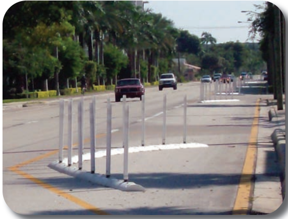
One travel lane in each direction on US 1 has been blocked off with temporary curbing.

The CRA made significant headway on several projects throughout the district in 2008. The goal of beautifying and reducing speeds along the US 1 Corridor took a step forward with the installation of temporary traffic barriers along NE/SE 5th and 6th Avenues between George Bush Blvd. (NE 8th Street) and SE 10th Street. The barriers are in the areas where the landscaping and parking improvements could ultimately be installed. The purpose of the temporary trial is to determine the impact of having one less lane of traffic for vehicles to use. The CRA budgeted $360,000 for the project. The trial will last for one year, through April 2009. If the project is approved, the temporary modifications will remain in place until permanent improvements are installed.